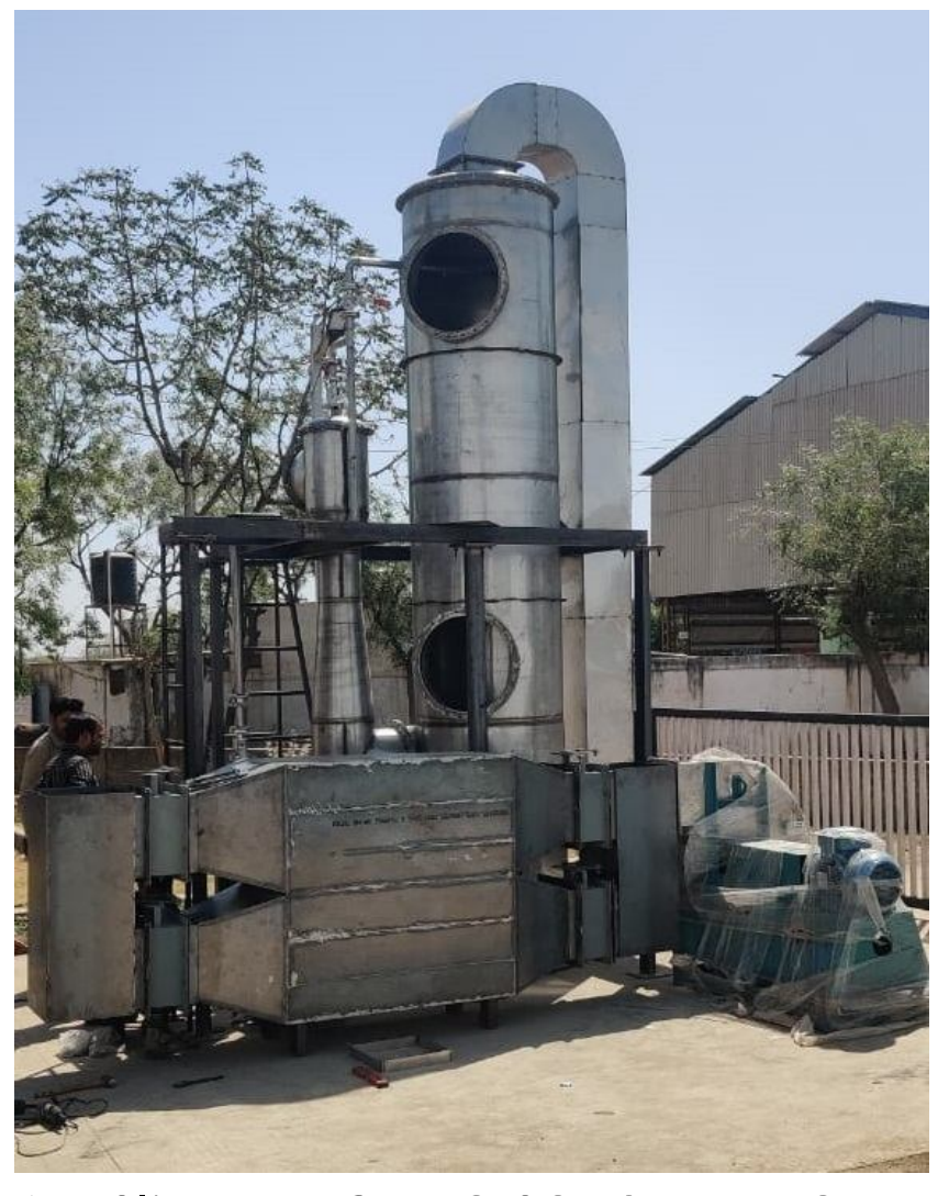
Client: ENGENIO CONSERVATION LLP